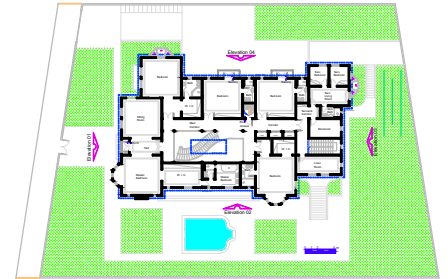
Second Floor Plan A = 394,12 m 2